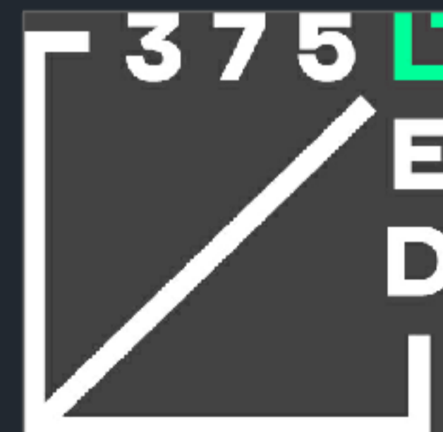
Axonometric Drawing 1 Axonometric Drawing 2